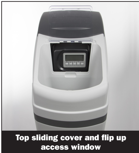
Top sliding cover and flip up access window