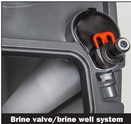
Brine valve/brine well system

The cabinet will be available for use with 18" and 35" tall media tanks including a 12" x 35" tank to maximize resin capacity. Control Valve and Mineral Tank not included.